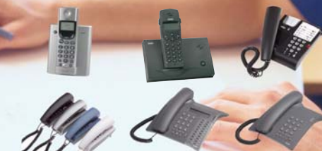
Phones shown above are only by way of example, many other phones are compatible.